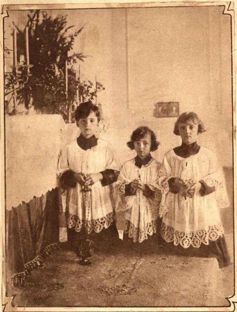
The Archduke Otto of Austria and Heir to the Title of Emperor of Austria (Left), with His Brothers, the Archdukes Felix and Robert, Serving at the Altar in the House Where They Are in Exile in Spain.